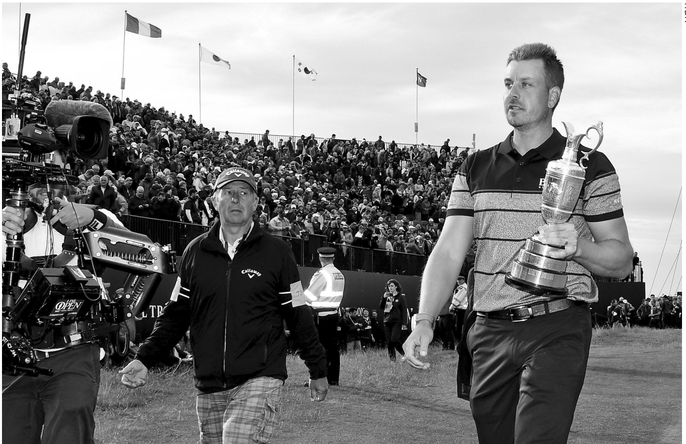
Here comes Sweden's first Open Champion Henrik Stenson parading the Claret Jug.

A summary of Årsskrift 2017. Published by The Swedish Society of Golf Historians.